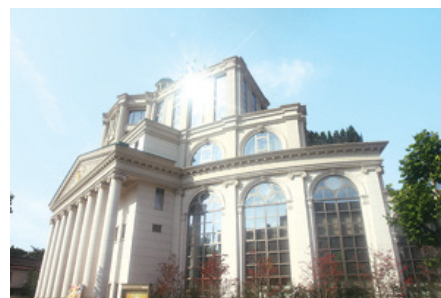
Tokyo Shoshinkan in Sengakuji