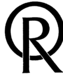
Happy Science logo