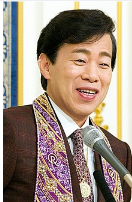
Ryuhō Okawa on February 15, 2015