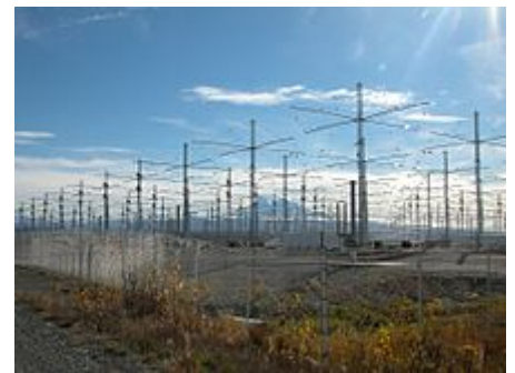
HAARP antenna array

The HAARP project directs a 3.6 MW signal, in the 2.8–10 MHz region of the HF (high-frequency) band, into the ionosphere . The signal may be pulsed or continuous. Effects of the transmission and any recovery period can be examined using associated instrumentation, including VHF and UHF radars, HF receivers, and optical cameras. According to the HAARP team, this will advance the study of basic natural processes that occur in the ionosphere under the natural but much stronger influence of solar interaction. HAARP also enables studies of how the natural ionosphere affects radio signals.