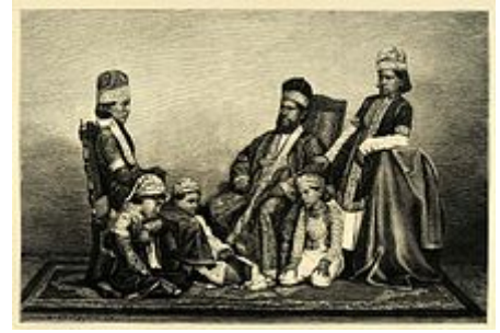
Mirzas of the Mughal imperial family c. 1878. [14]