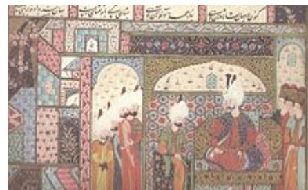
Alqas Mirza meeting Suleiman the Magnificent. Illustration from the Süleymanname .