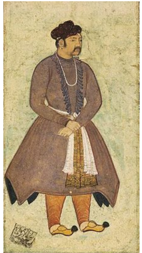
Akbar Mirza (born Mirza Abu'l-Fath Jalal-ud-din Muhammad), one of the most popular Mughal kings of India, known as "Akbar the Great".