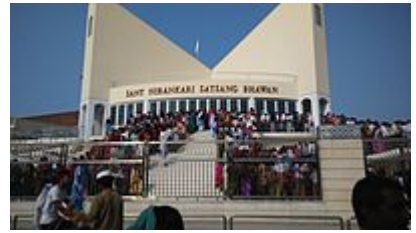
Sant Nirankari Samagam at Sant Nirankari Colony, New Delhi on 16 Nov 2014