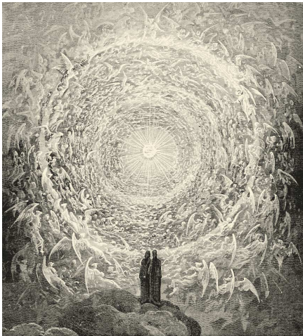
Paradiso Canto 31

The major theoricist of angel hierarchy remains Pseudo-Dionysius the Areopagite, dans sa Celestial Hierarchy (around 490).